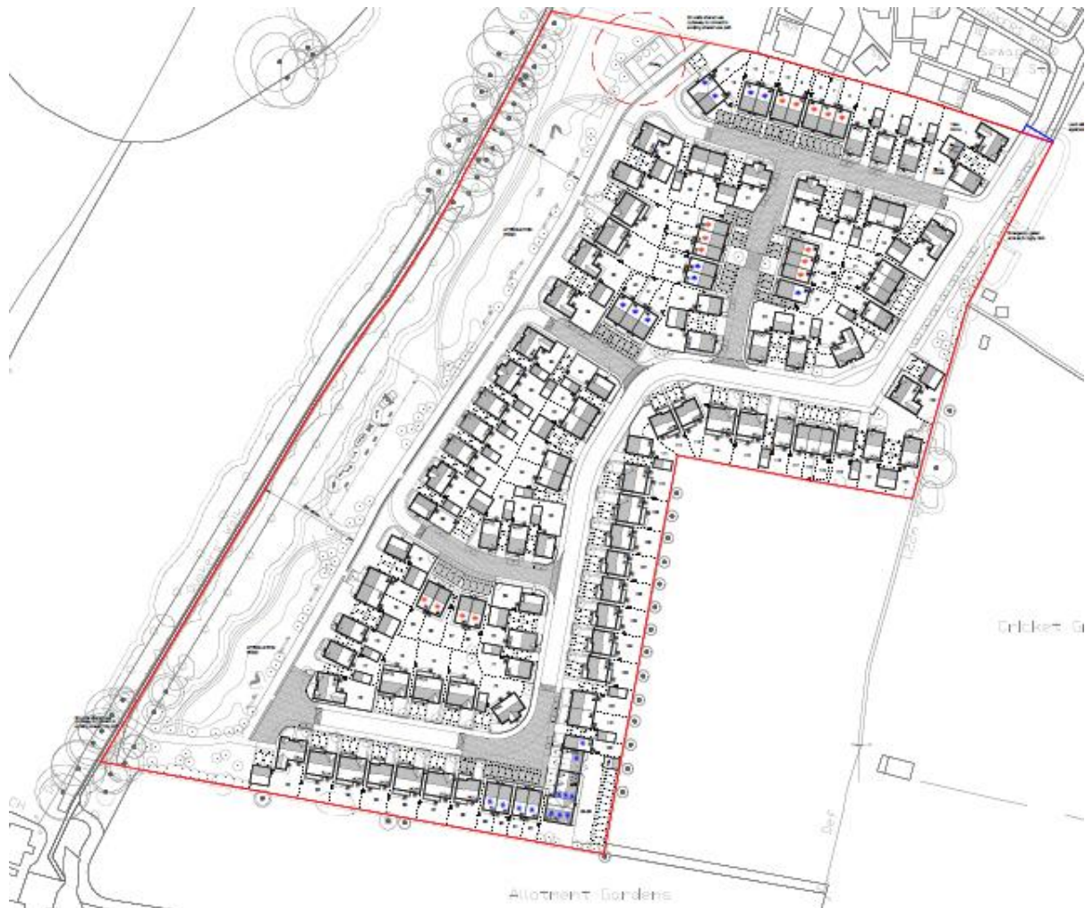
Site Layout Plan

associated open space including play area, attenuation basins, and site infrastructure at Land at Quakers Road, pursuant to Outline Planning Permission 15/01388/OUT