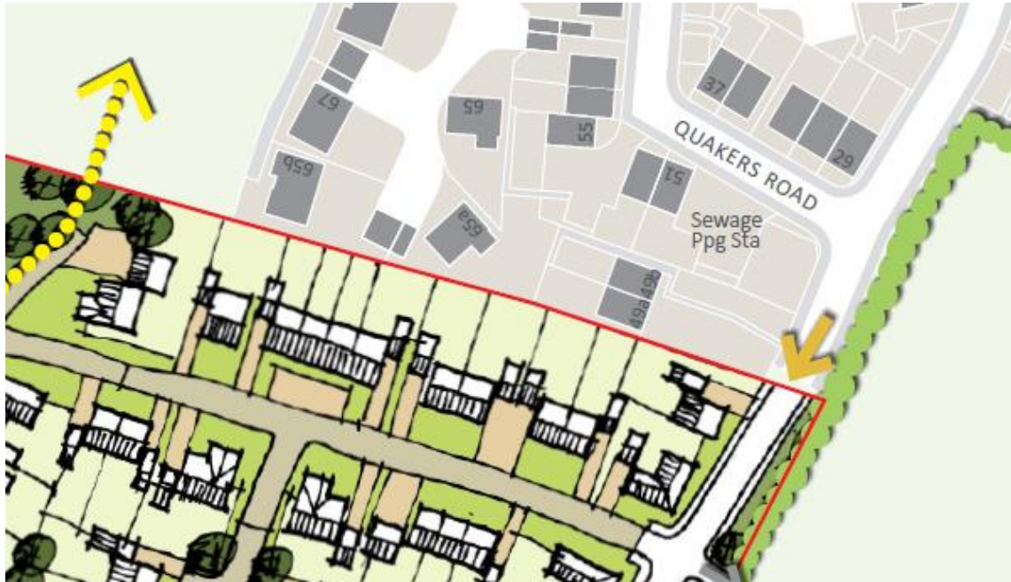
Indicative Master Plan considered at outline stage

As was clear at outline stage the proposal included the provision of housing along the northern boundary with rear gardens backing onto the adjacent existing dwellings. The indicative masterplan identified up to 11 properties bordering along this boundary.