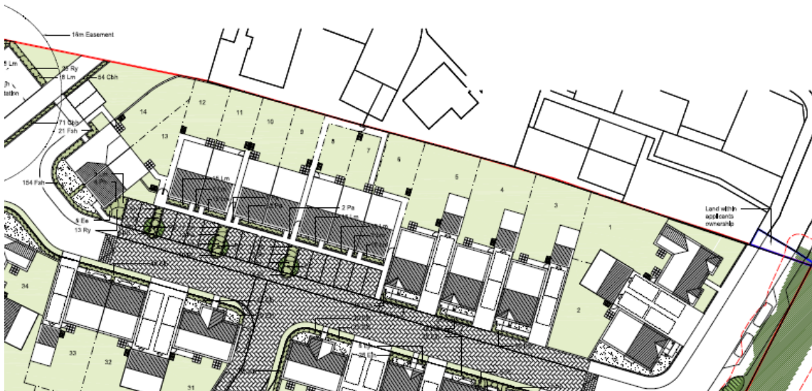
Proposed site layout (REM)

As was clear at outline stage the proposal included the provision of housing along the northern boundary with rear gardens backing onto the adjacent existing dwellings. The indicative masterplan identified up to 11 properties bordering along this boundary.